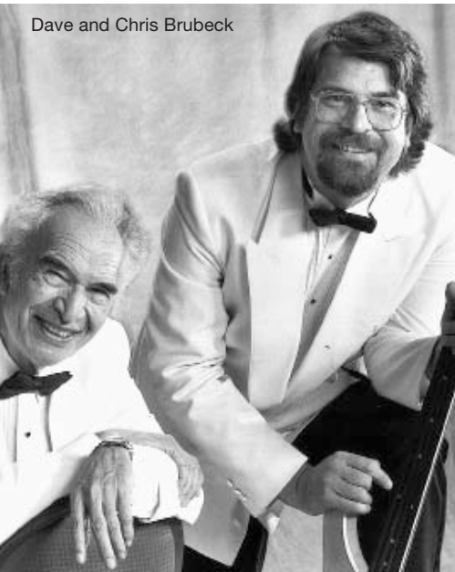
Dave and Chris Brubeck